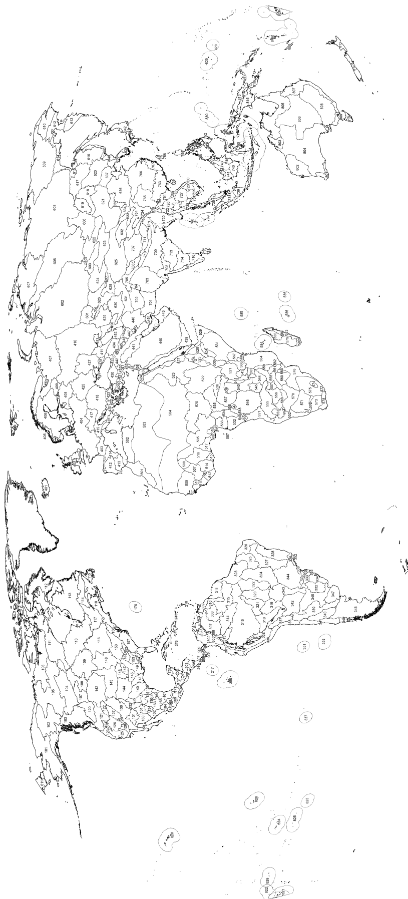
Figure 1. Map of freshwater ecoregions of the world, in which 426 ecoregions are delineated. An interactive version of this map that includes additional information is available at www.feow.org .